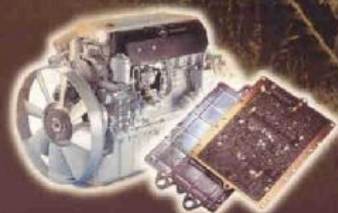
The "Thinking Power Plant"