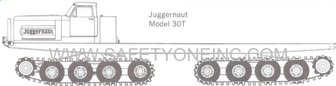
Juggernaut Model 30T