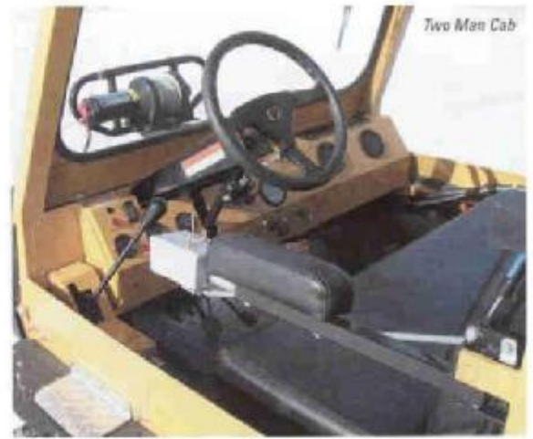
Two Men Cab