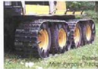
Rubber Multi-Purpose Tracks