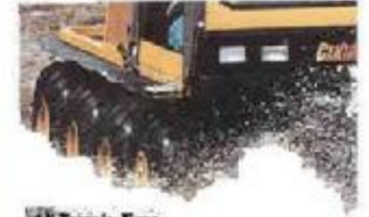
All Terrain Tires