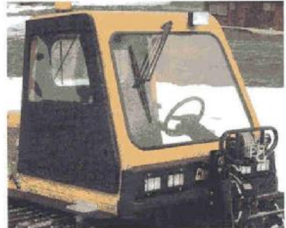
ROPS Cab with Removable Doors