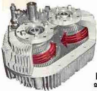
Quad/Drive transmission — a Ridge Runner exclusive

Winter, water, woods or whatever. It's the Aqua-Trac that gets you there, ready for work or play. Roomy comfort...All Season Track Vehicle that is what it says.