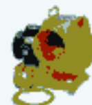
CE Portable Industrial Blowers